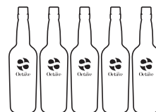
Around 88 bottles of exclusive Scotch Whisky